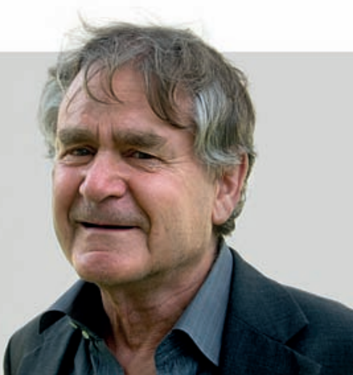
In his 1965 book The Logic of Statistical Inference , the philosopher Ian Hacking formulated the law of likelihood.

to discriminate between the two hypotheses. The same pattern applies to useless and useful similarities in Darwin's discussion: